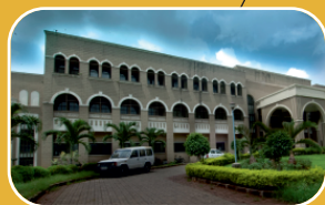
HBNI Central Office